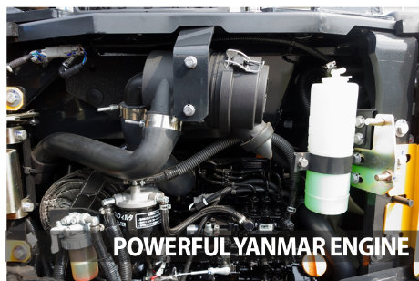
POWERFUL YANMAR ENGINE