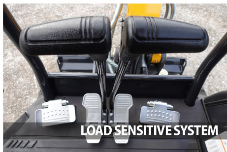
LOAD SENSITIVE SYSTEM