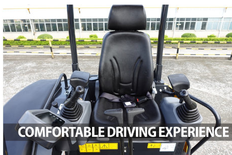
COMFORTABLE DRIVING EXPERIENCE