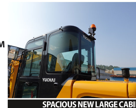
SPACIOUS NEW LARGE CABIN